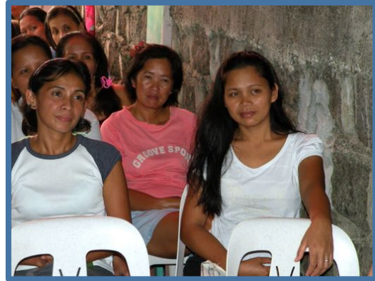
Beneficiaries of the Microfinance Business School Project attending Small Business Training

These Social Businesses provide valuable training, up-skilling and employment to the poor whilst also producing meaningful products and services. They also provide a "rich and engaging" alternative to traditional one-off philanthropic gifts.