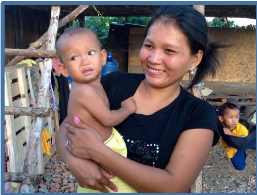
Healthy Mother and Baby - Beneficiaries of the Maternal Care Program

In the health education sphere, collaboration with Cambodian Children's Fund has resulted in the development of a best practice project working to overcome maternal and infant rates in the Steung Meanchey district of Phnom Penh, home of the infamous "Smokey Mountain" dumpsite.